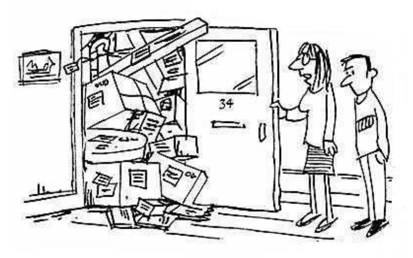
"You got carried away again, didnt you!"